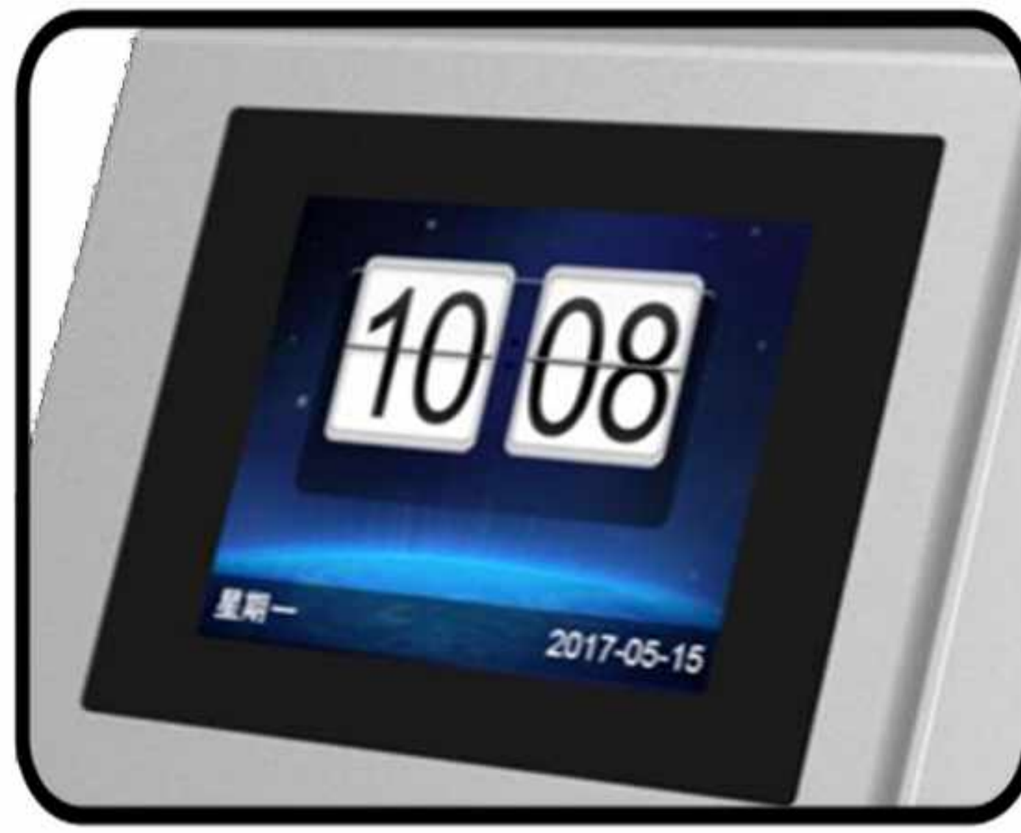
2.4 Inches TFT Color Screen