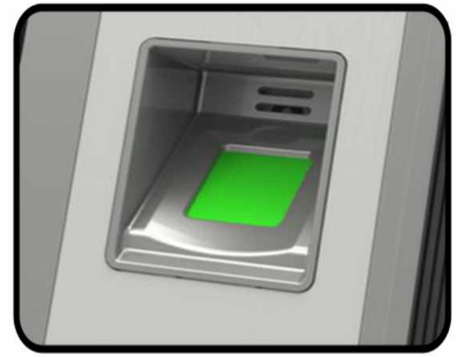
Optical Fingerprint Sensor