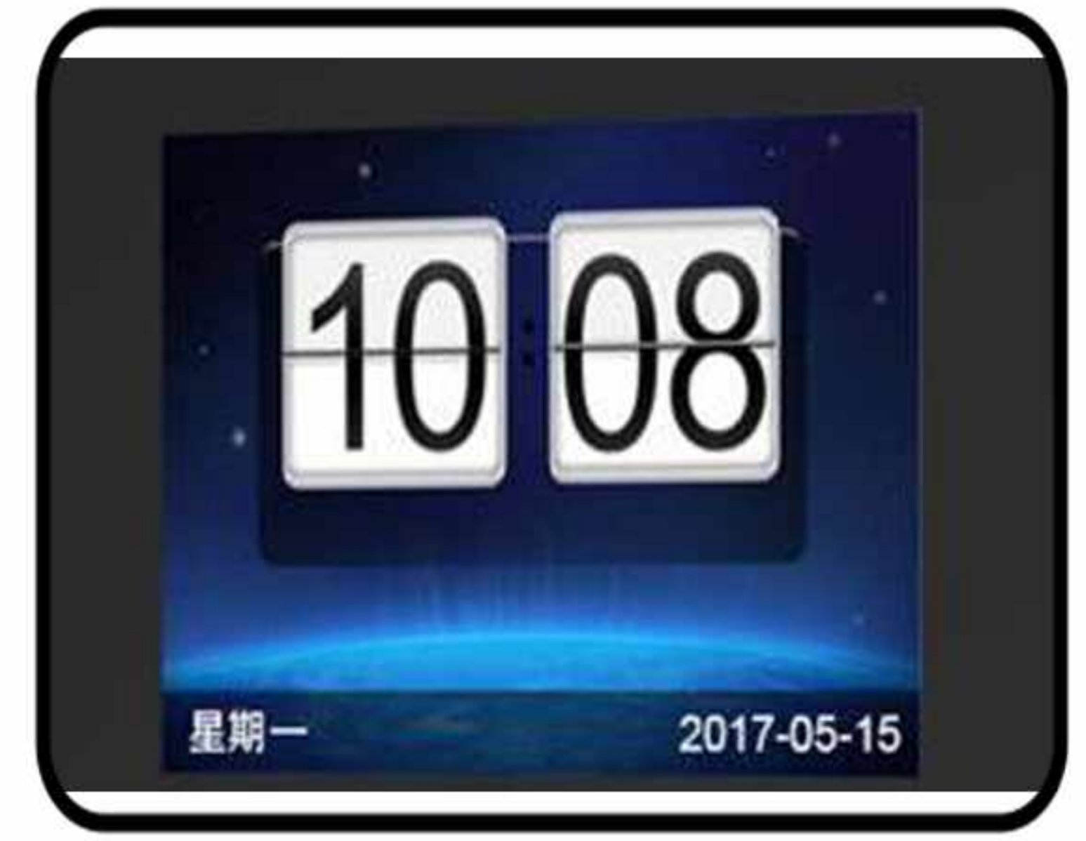
3.2 inches LCD