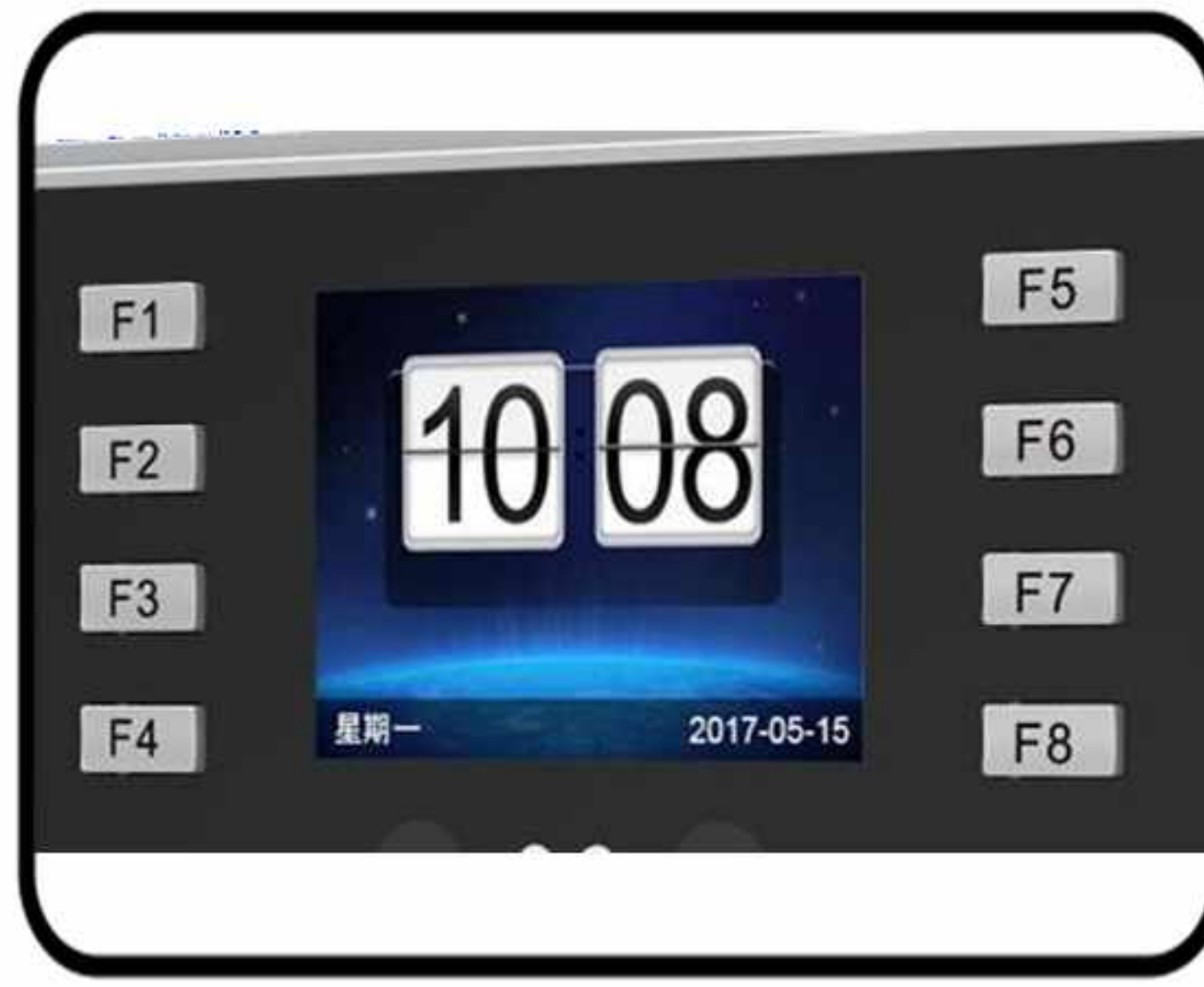
Function Key for Shortcut